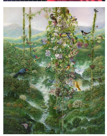
Bird, Nest, Nature July 12 – October 18, 2020

Walnut Creek, CA - Bedford Gallery is thrilled to reopen to the public on July 12, 2020 with our juried and invitational exhibition Bird, Nest, Nature . Following guidelines outlined by Contra Costa Health Services, indoor museums, including our gallery, can reopen as of July 1. The health and safety of our visitors is our top priority; please read our new safety procedures below or visit <a href="mailto:bedfordgallery.org/about/visiting">bedfordgallery.org/about/visiting</a> to learn more.